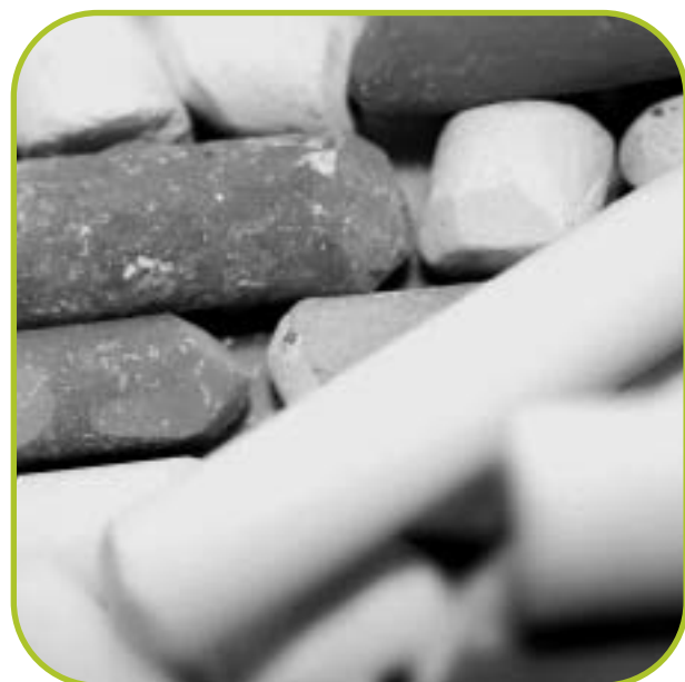
Chalks - Takasi75 ©