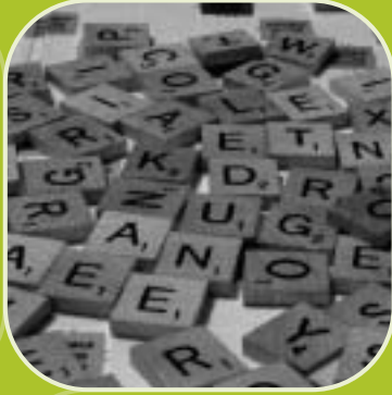
Scrabble - Allyrose18 ©