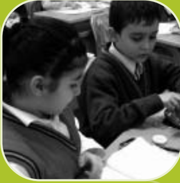
GOSSIP - R@punsell ©