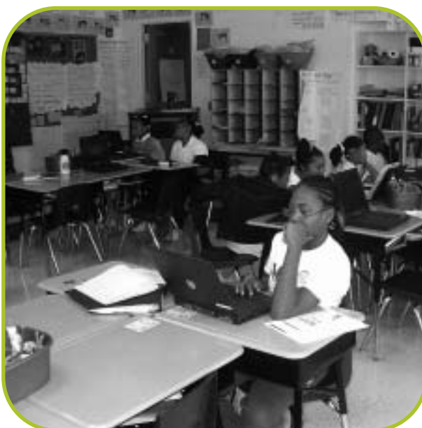
Working on power points

The Freedom Toaster project aimed to design a software and content vending machine-like kiosk where users could access a range of stored open source operating systems, software and other open content, select their desired packages and burn these to CD or DVD which they could then take home and use. This would be of particular use in areas with limited bandwidth, where content could not be easily downloaded or for use at educational institutions where a range of content can be provided quickly and easily. The project successfully completed this goal and is now run as an independent and successful business.