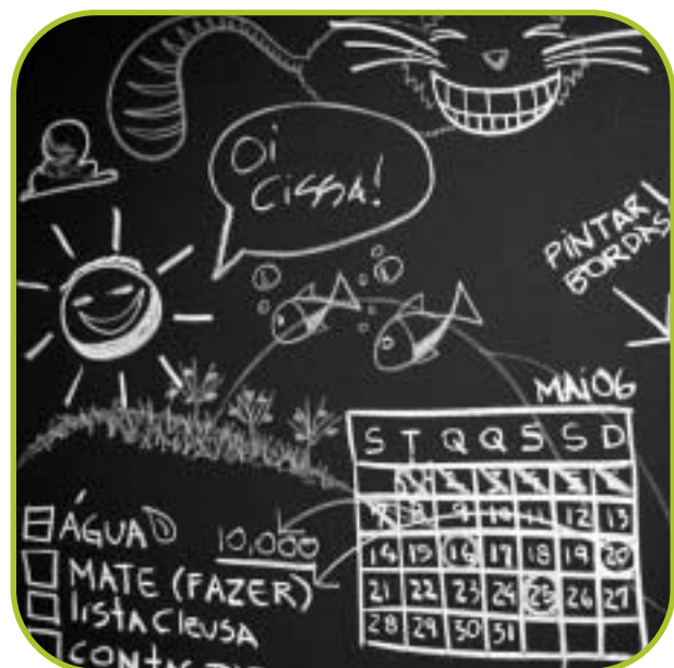
Blackboard Collective - Invertebra ©

The team works tirelessly towards these goals adopting projects that carry a common focus and defending the rights of individuals in terms of information access and knowledge exchange, while