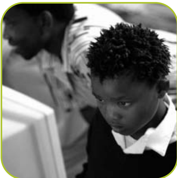
Image 1588

“The Shuttleworth Foundation focuses on projects that are the catalyst for change and policy reform in South Africa.”