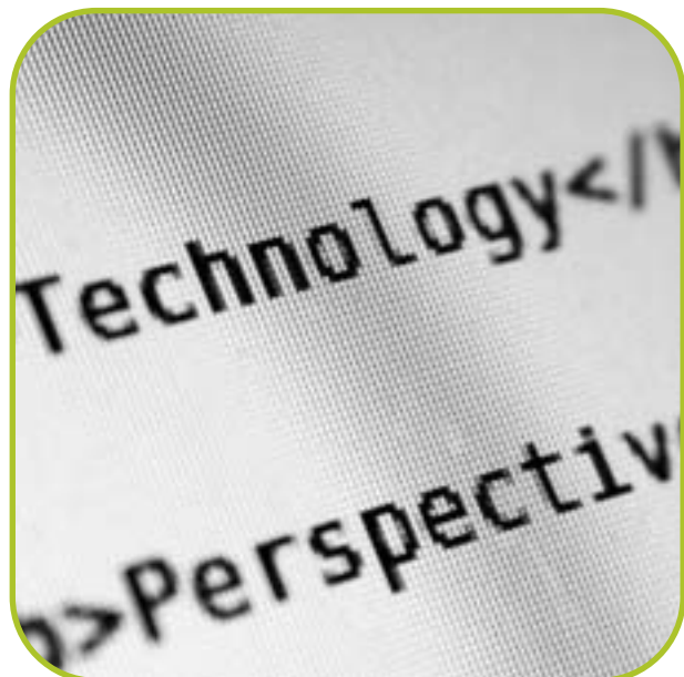
Screen Technology – Rutty © © ©