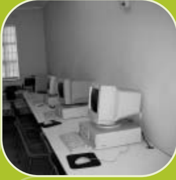
AtlantisSS - Jason Hudson ©